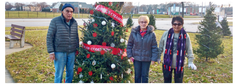
Justice of Chamber Christmas Tree

L: Santa Claus makes his grand entrance to the Village of Justice.