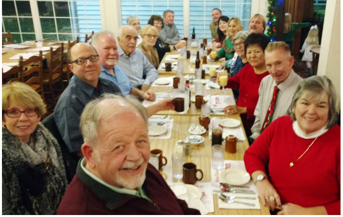
Justice Chamber of Commerce Christmas Dinner